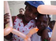
Mission Discovery is a Christian organization whose mission is, “To serve Jesus Christ by

press. I felt it was not my place to represent millions of deceased and hurting people when I was ostensibly safe and comfortable in my house on Academic Circle. So, I accepted a challenge that my daughter had offered two consecutive years before the earthquake: I took a service trip to Mission Discovery to help orphans impacted by the earthquake. It was a week-long trip that lasted from April 12-17, 2010.