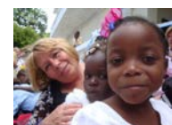
representatives of the

I rejected opportunities to “give a voice to the Haitian survivors” by speaking to various