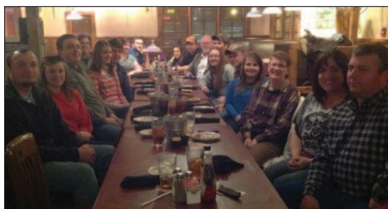
ATA students and advisors at the year-end banquet.