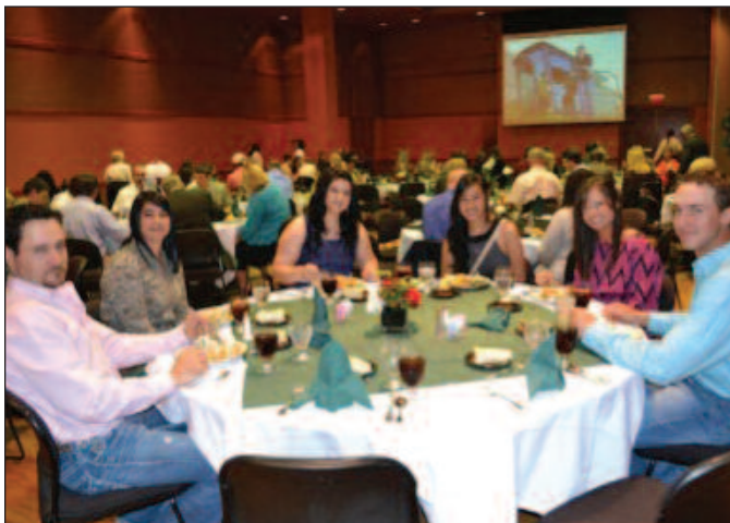
The college filled the Centennial Hall at the Honors Banquet!