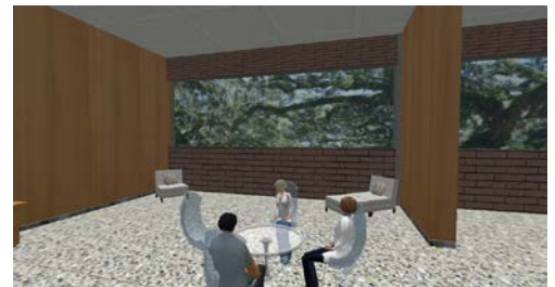
Virtual team meeting at ASU Memorial Hospital