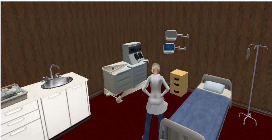
Inside the ASU Memorial Hospital