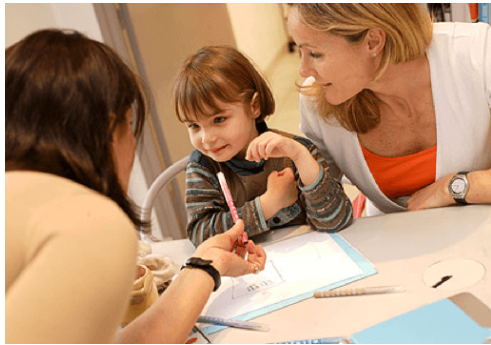
A Social Worker talking to a child.