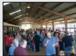
Above left: the barn crowded on Saturday