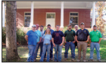
This joint effort to improve the grounds with the Arkansas Forestry Commission will help enhance the campus for all those who enjoy walking