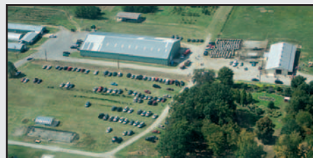
Below: aerial view of farm during the petting zoo on Saturday reveals the scope of the event