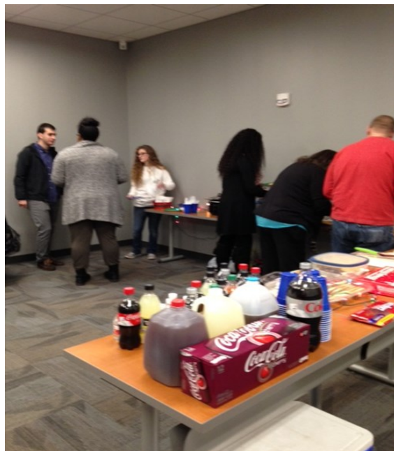
Like any good Christmas Party, there was lots to eat and drink!