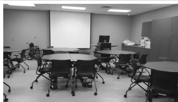
Two of four new occupational therapy labs that have been completed for the new OTA and OTD degree programs. The ADL lab (left) is for practicing daily living skills. The Media lab (right) is for skills such as sewing, crafts, splinting and anything that requires machines that use electricity.