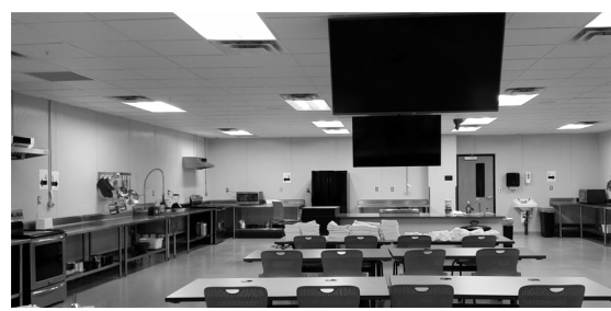
The Nutritional Science program's new lab space on the fourth floor of the E. Smith building.

This area will serve as space for students enrolled in NS 3143 Basic Foods and NS 4443 Experimental Foods offered in the Nutritional Science program, among other classes and program usage. The room is equipped with five student kitchen units and a teacher island unit for hands on food preparation and instructional activities.