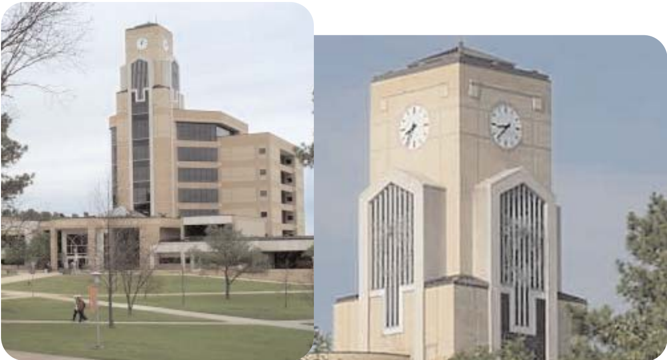
ASU-Jonesboro Dean B. Ellis Library

Credit risk - Applicable investments of the Common Fund portfolio had an average quality rating of AA+, while applicable investments of the TIAA/CREF portfolio had an average quality rating of B1 to AA1.