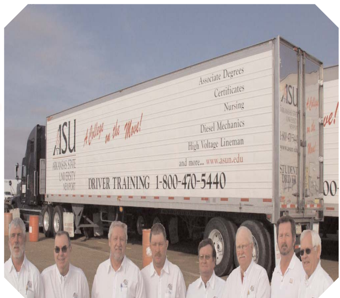
ASU-Newport Commercial Driver Training Students