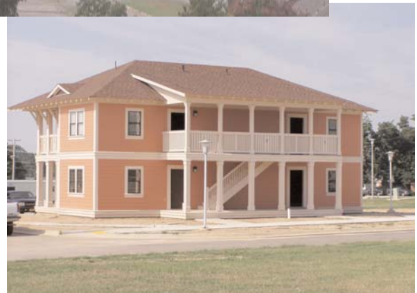
ASU-Jonesboro New Family Housing Apartments-Phase II