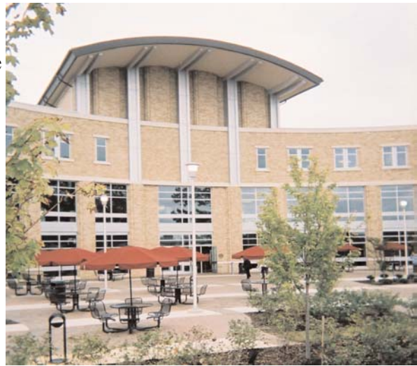
ASU-Jonesboro Student Union

A branch campus at Beebe, Arkansas was added to Arkansas State College by an act of the General Assembly of the State of Arkansas in 1955. The branch campus was designated as Arkansas State College - Beebe Branch. Under the provisions of Ark. Code Ann. 6-53-405, White River Technical College was consolidated with Arkansas State University - Beebe campus effective July 1, 1992 and named Arkansas State University - Newport. Act 90 of 2001 eliminated the word “branch” from the references to campuses of Arkansas State University. Subsequently, the Newport campus separated itself from Beebe to become a stand-alone campus. ASU - Heber Springs, a Center of ASU - Beebe, was officially established by Act 426 of 1999 in response to the community’s desire to have a two-year college presence in Cleburne County. Effective July 1, 2003, Foothills Technical Institute in Searcy merged with ASU - Beebe to become ASU - Searcy, a Technical Campus of ASU - Beebe.