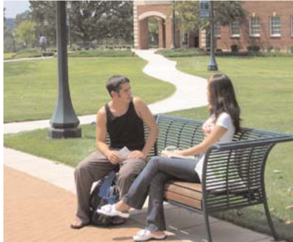
ASU-Mountain Home Students

This section of the Arkansas State University (The University) annual financial report presents discussion and analysis of the University's financial performance during the fiscal year ended June 30, 2005. This discussion and analysis is prepared by the University's financial administrators and is intended to provide information on the financial activities of the University that is both relevant and easily understandable. Information is also provided on the University's financial position as of June 30, 2005 as further explanation of the results of the year's financial activities.