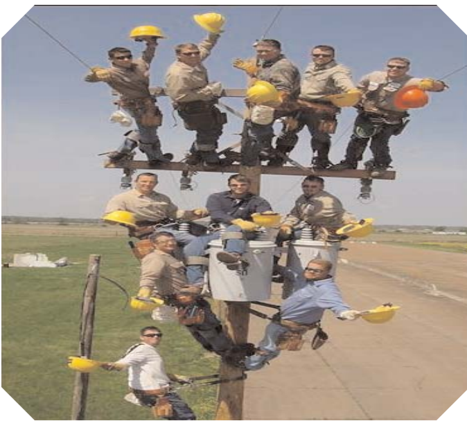
ASU-Newport High Voltage Linemen Technology Students

Economic conditions at the state and national level continue to improve, however, the likelihood of significant new resources being appropriated for the operation of University is remote. Additionally, the ability of the University to raise significant new amounts of revenue through tuition and fee assessment is increasingly constrained by regional and state demographics and competition between Arkansas's institutions of higher education. Continued emphasis on cost containment and resource reallocation will be required as necessary means of providing resources for new initiatives, maintaining the University's financial position, and continuing its mission.