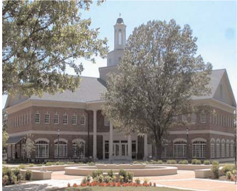
Roller Hall at ASU-Mountain Home

Land, buildings, improvements and infrastructure, equipment, audiovisual holdings and construction in progress are recorded at cost at the date of acquisition or fair market value at the date of donation in the case of gifts. Livestock held for educational purposes is recorded at cost or estimated fair value. Library holdings are recorded at cost or a stated rate per volume. Library holdings that are capitalized do not include periodicals, microfilm, microfiche and government documents. The University's capitalization policy for equipment is to record, as assets, any items with a unit cost of more than $2,500 and an estimated useful life greater than one year. Improvements to buildings, infrastructure, and land that significantly increase the value or extend the useful life of the assets are capitalized. Routine repairs and maintenance are charged to operating expense when incurred.