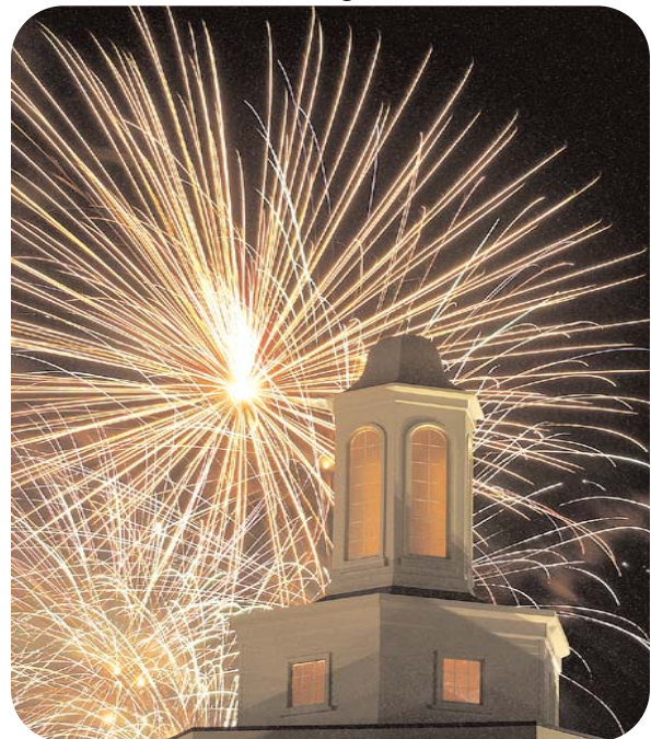
ASU Mountain Home-Roller Hall