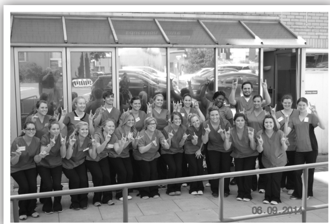
Students from the Medical Imaging and Radiation Sciences department and the School of Nursing participated in a three-week, study-abroad course in June 2014 in London, England. See article on our web site.