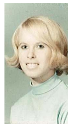
WHO IS THIS YOUNG LADY?