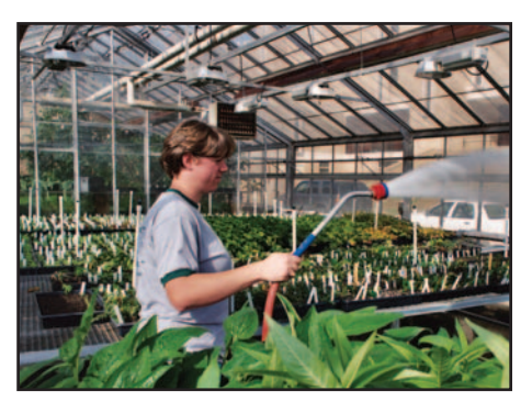
Students gain practical experience in the greenhouse