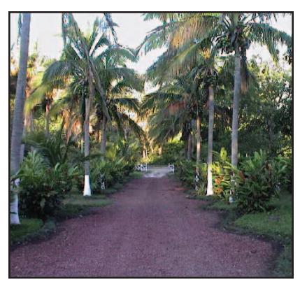
Entry drive to the Costa Rican farm where we stayed