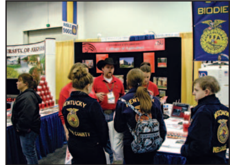
College of Ag Booth at National FFA Convention