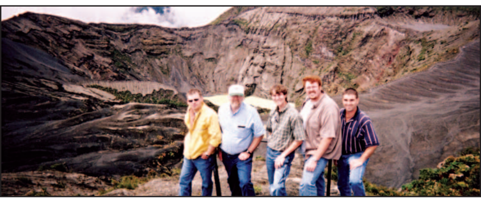
Students on the edge of inactive volcano in Costa Rica