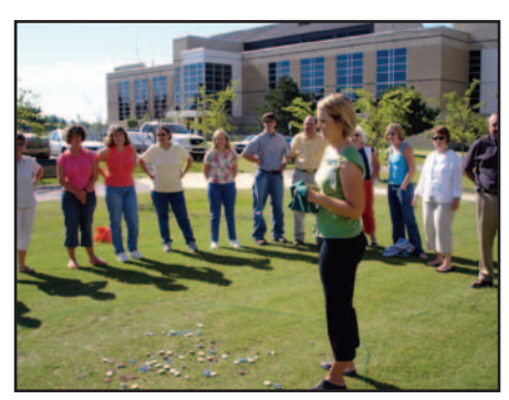
Teachers learn how to integrate ag into the classroom